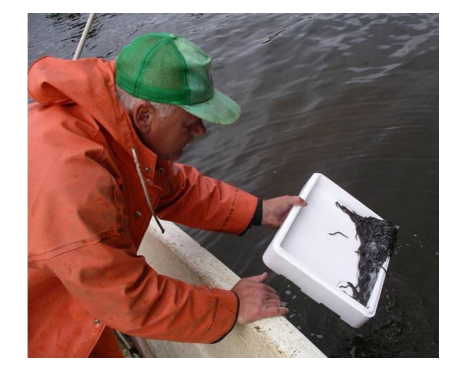
Figure 2. Otolith marked with two strontium rings and to the right restocking in fresh water.